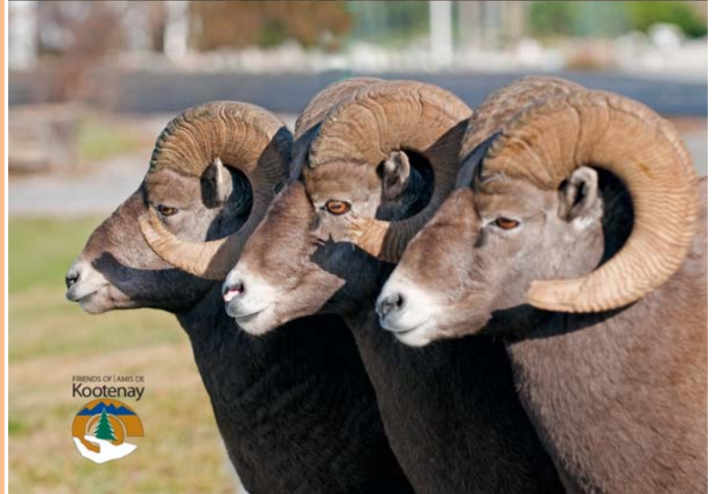
The Bighorns of Radium Hot Springs